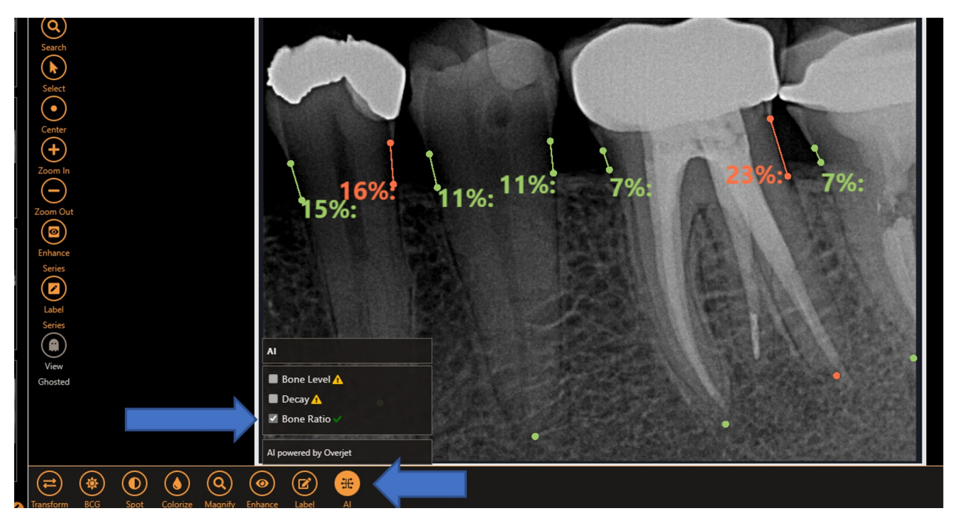
Periapical x-ray displaying bone ratio indicators in green and red.