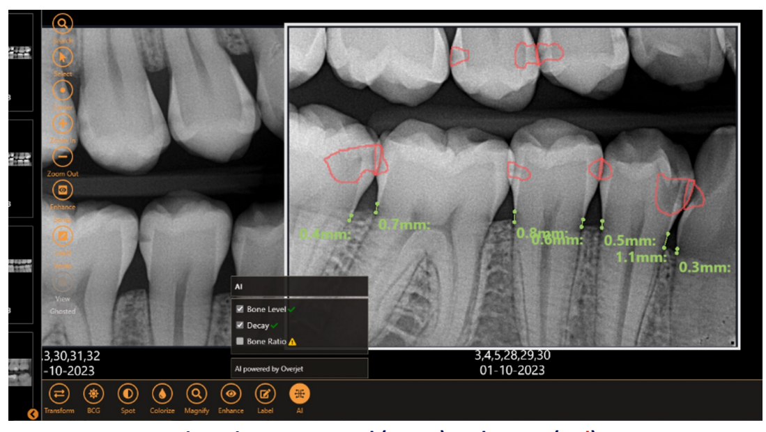
Bite Wing: Bone Level (green) and Decay (red)

3. To remove an indicator, click on the AI icon on the bottom of the screen. A pop-up will appear. Uncheck the box of the indicator you wish to remove from the x-ray.