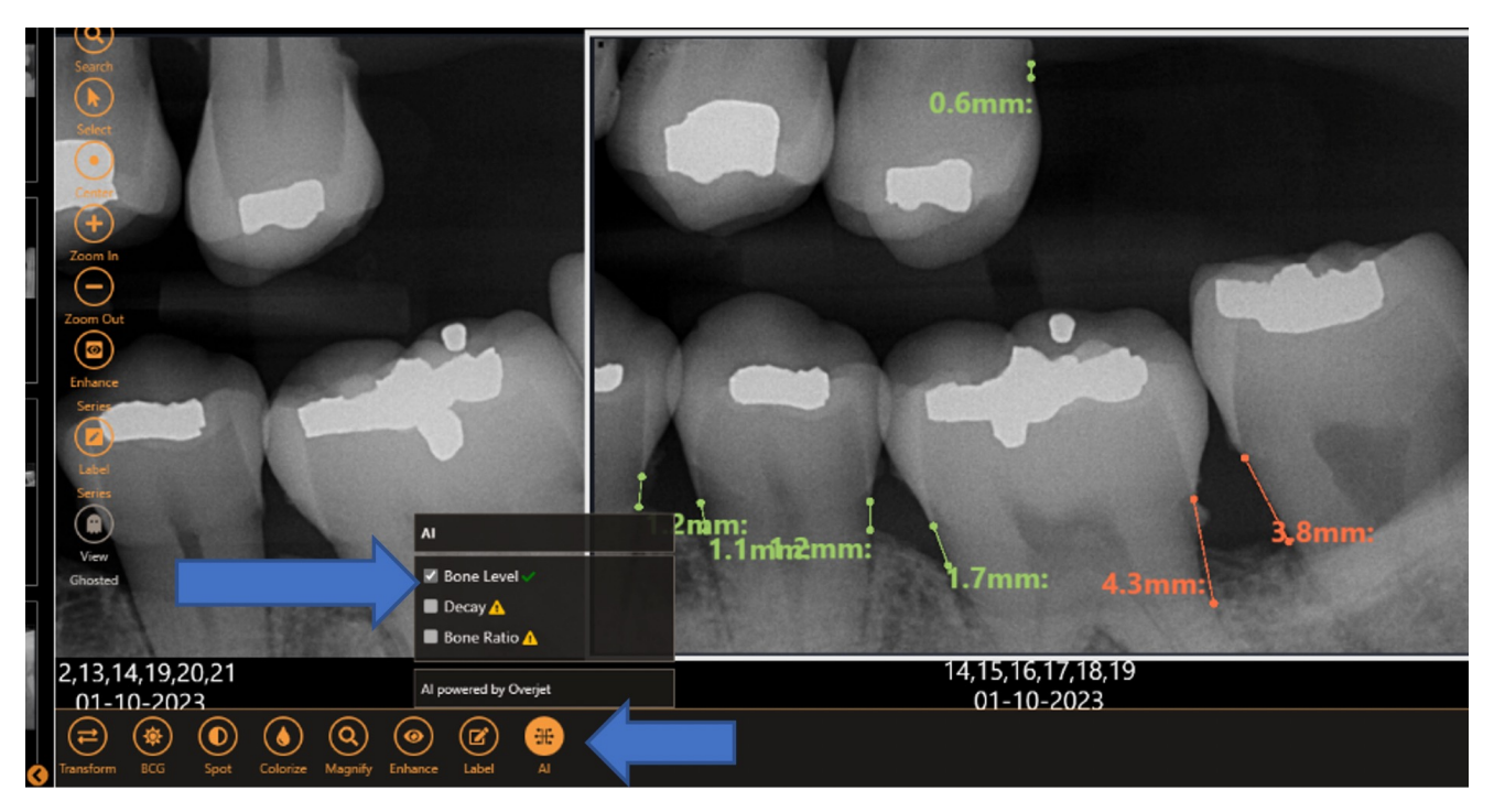
Bitewing x-ray displaying Bone Levels below 3 mm (green) and above 3mm (red).