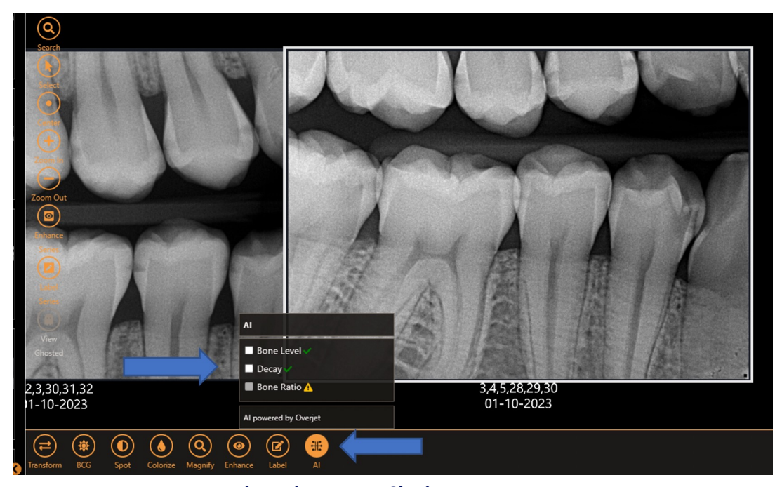
Bite Wing X-ray: Closing AI Feature