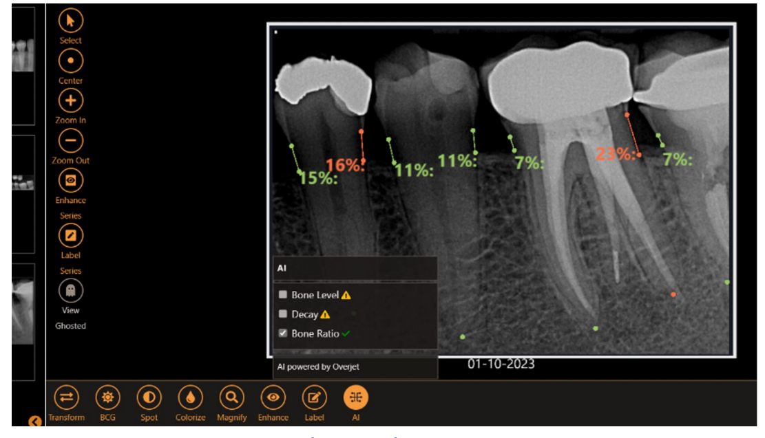
Periapical X-Ray: Shows Bone Ratio

3. To remove an indicator, click on the AI icon on the bottom of the screen. A pop-up will appear. Uncheck the box of the indicator you wish to remove from the x-ray.